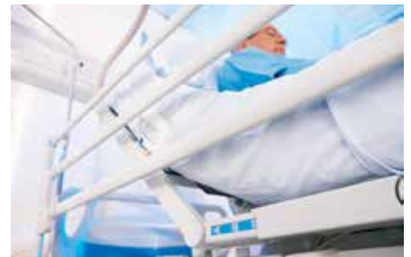
Line-Of-Site indicator ensures easy patient positioning