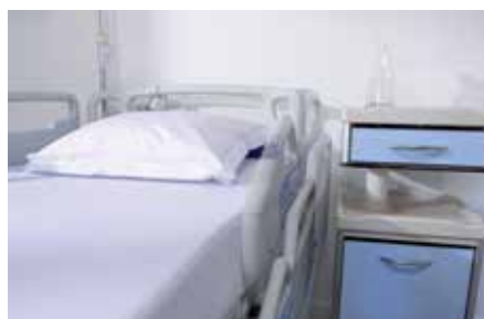
Siderails take up only 4 cm of bedside space