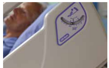
Easy-to-read angle indicators