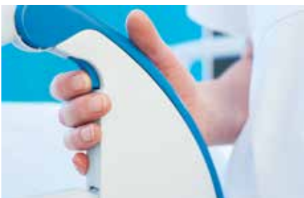
Double lock-out enhances safety