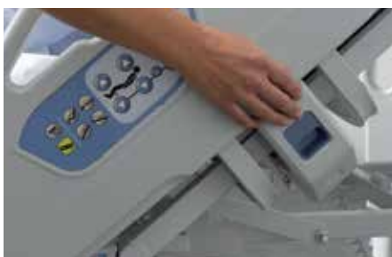
One-handed siderail release