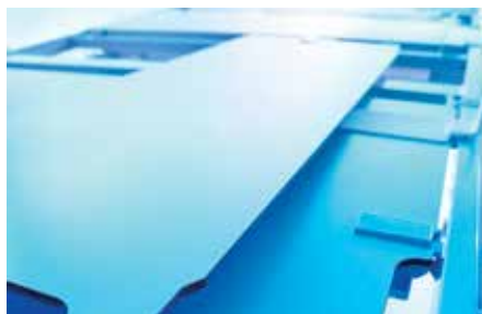
Easy to clean sleep deck sections offer improved hygiene